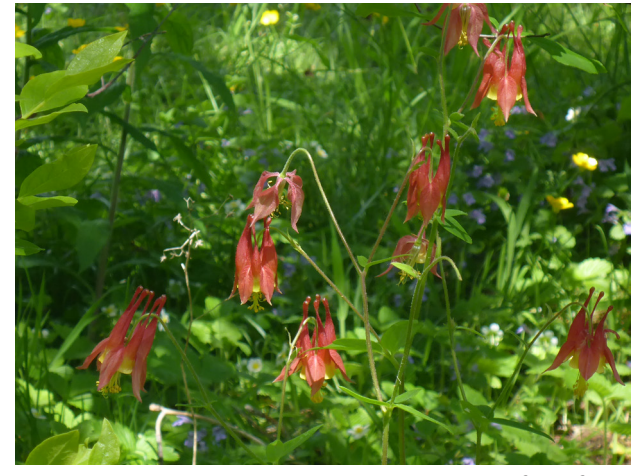
Wild columbine (Aquilegia canadensis). One of the few spring wildflowers with bright colors, this short-lived perennial spreads by seed, so you never know exactly where it will pop up.