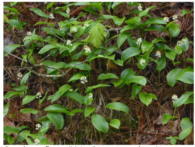
Canada mayflower (Maianthemum canadense). The single-leaf stalks blanket the woodland floor, unremarkable until they send up a delicate white flower. Its cousin, false Solomon seal, has a similar flower but multiple, narrower leaves.

Here are some of the gems you might find, but please remember to take only pictures, leaving the blooms for the pollinators and for others to enjoy.