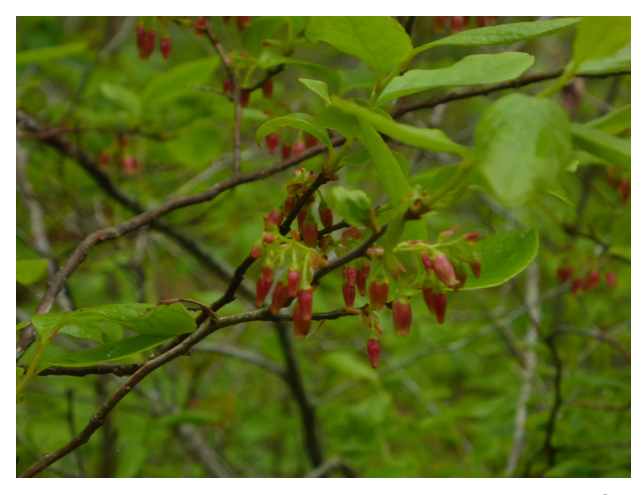
Black huckleberry (Gaylussacia baccata). The edges of our oak-pine woods are often covered in thickets of this low shrub, a relative of the low-bush blueberry, with its bell-shaped flowers. Bees will hover under the flowers, and the vibrations from its wings will release pollen onto their backs.