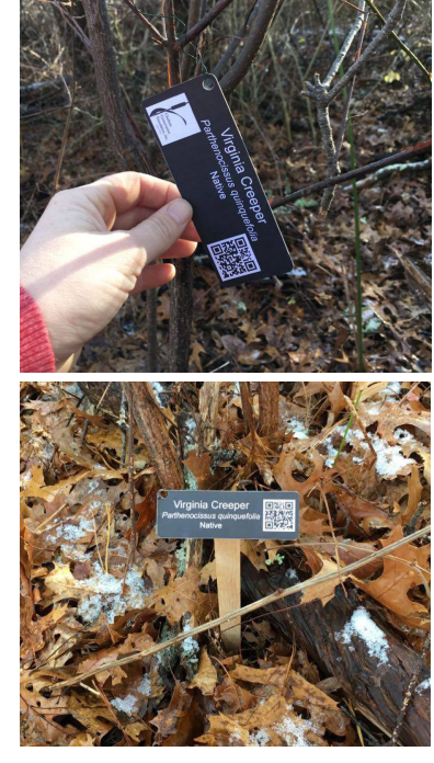
Two types of plant tags are being considered for the Frost Fish Creek Trail. The upper photo is a tag on the branch and the lower photo shows the tag placed in the ground.

This spring we are hoping to pick up group stewardship projects once again. Over the past year, with the help of volunteers and AmeriCorps Cape Cod we have made progress on invasive species restoration projects. You really cannot turn your head on invasive species for a season and we will need help maintaining and advancing the progress we have made. Additionally, trails will need their routine care.