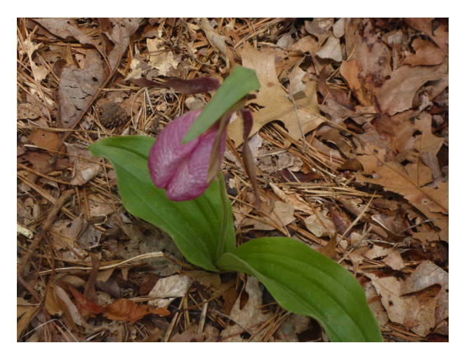
Lady's slipper (Cypripedium acaule). This member of the orchid family is one of our rarest spring wildflowers, so it is a lucky treat to spot one. They like the rich soil and dappled shade of an open woodland.