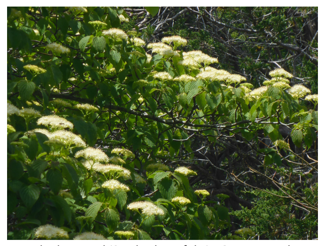
Pagoda dogwood (Swida alternifolia). Growing in the moister areas, this small tree features fluffy white flower clusters on tiered branches that resemble a pagoda.