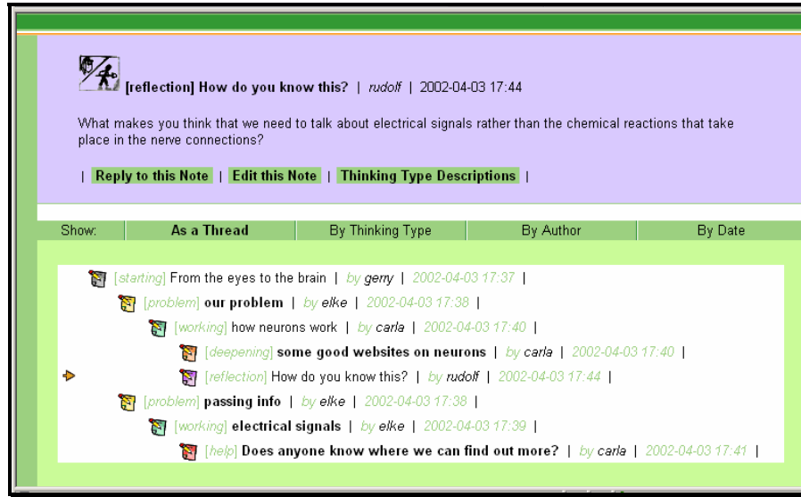
Figure 2. The group knowledge building area. This area provides an overview of the discussion within a group and offers an interface for engaging in the knowledge building process.

At some point in the collaborative knowledge building process, Carla thinks that the group members have something almost ready to present to the course as a “knowledge artifact” or part of their team “knowledge portfolio.” So she puts this information together in a folder named “Good documents we found about vision” and makes a proposal to share this with the course. Now the group area contains a proposal folder named “The Vision Team’s proposal 1” (see Figure 1).