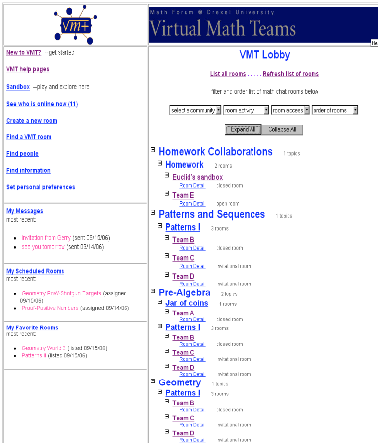
Figure 2-2. The VMT lobby.